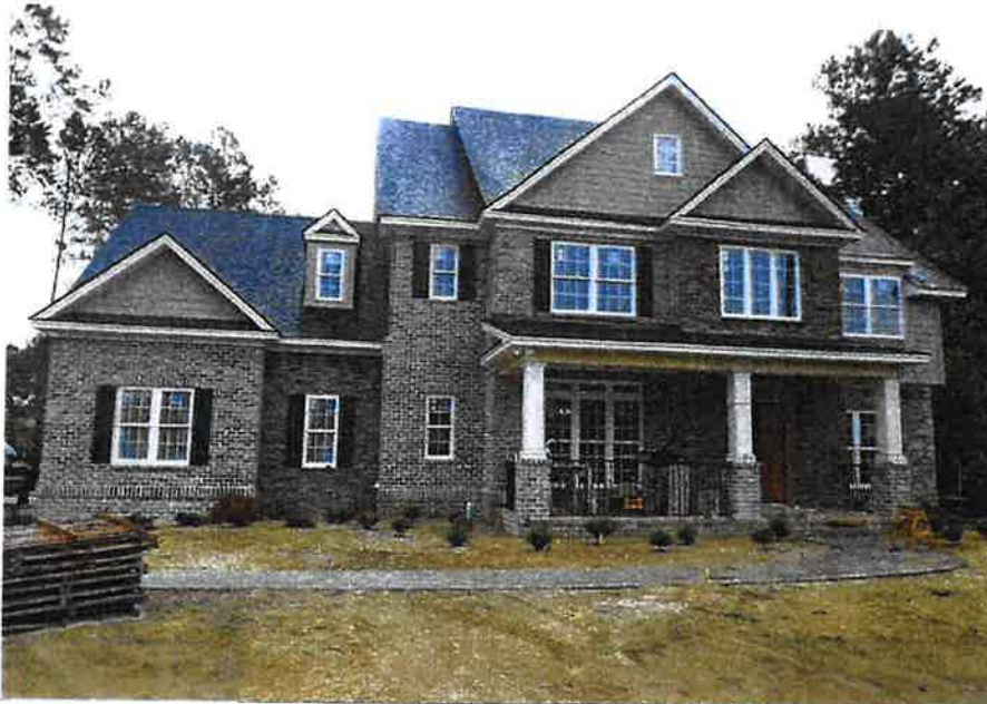
PHOTOGRAPHS TAKEN JULY 30, 2015

If using the Elevation Certificate to obtain NFIP flood insurance, affix at least 2 building photographs below according to the instructions for Item A6. Identify all photographs with date taken; "Front View" and "Rear View"; and, if required, "Right Side View" and "Left Side View." When applicable, photographs must show the foundation with representative examples of the flood openings or vents, as indicated in Section A8. If submitting more photographs than will fit on this page, use the Continuation Page.