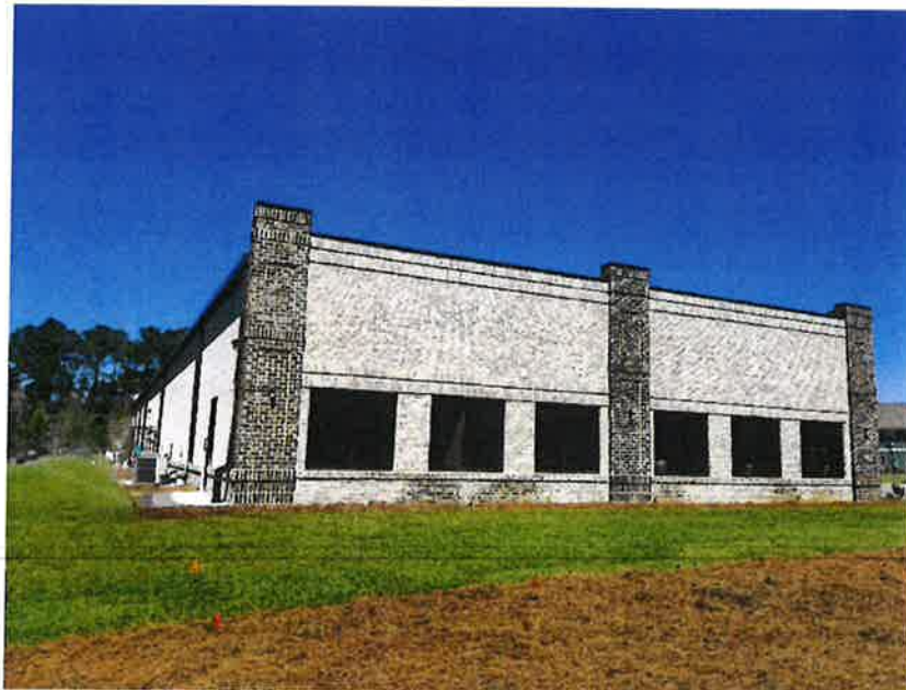
Photo Two Caption LEFT REAR VIEW 3/5/2018