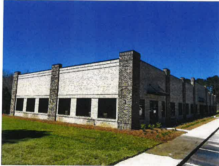
Photo One Caption LEFT FRONT VIEW 3/5/2018

If submitting more photographs than will fit on the preceding page, affix the additional photographs below. Identify all photographs with: date taken; "Front View" and "Rear View"; and, if required, "Right Side View" and "Left Side View." When applicable, photographs must show the foundation with representative examples of the flood openings or vents, as indicated in Section A8.