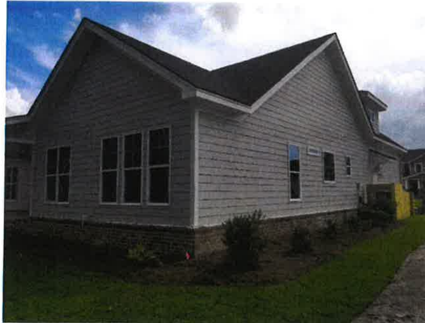
Photo One Caption LEFT VIEW 10/1/2018

If submitting more photographs than will fit on the preceding page, affix the additional photographs below. Identify all photographs with: date taken; "Front View" and "Rear View"; and, if required, "Right Side View" and "Left Side View." When applicable, photographs must show the foundation with representative examples of the flood openings or vents, as indicated in Section A8.