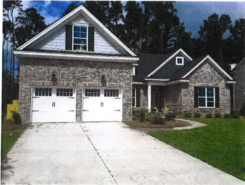
Photo One Caption FRONT VIEW 10/1/2018

If using the Elevation Certificate to obtain NFIP flood insurance, affix at least 2 building photographs below according to the instructions for Item A6. Identify all photographs with date taken; "Front View" and "Rear View"; and, if required, "Right Side View" and "Left Side View." When applicable, photographs must show the foundation with representative examples of the flood openings or vents, as indicated in Section A8. If submitting more photographs than will fit on this page, use the Continuation Page.