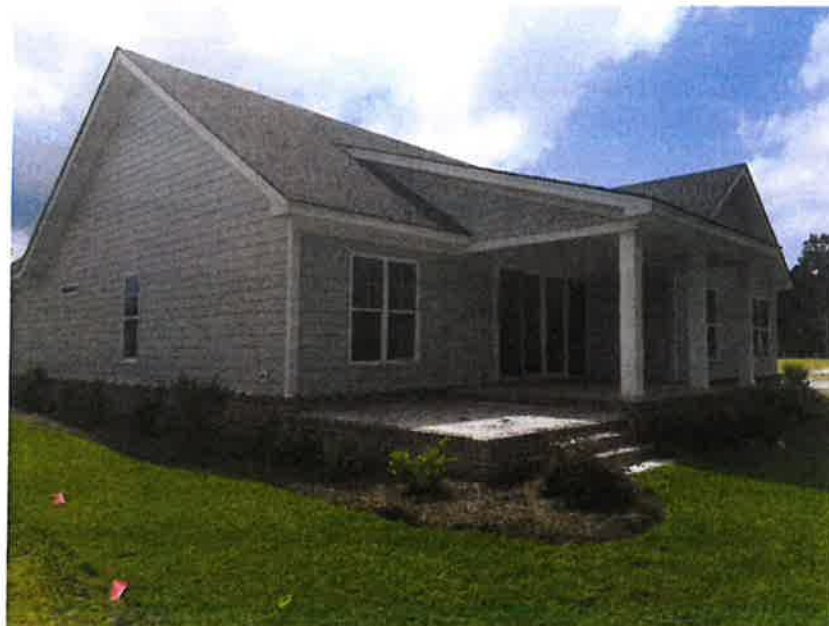
Photo Two Caption REAR VIEW 6/7/2018