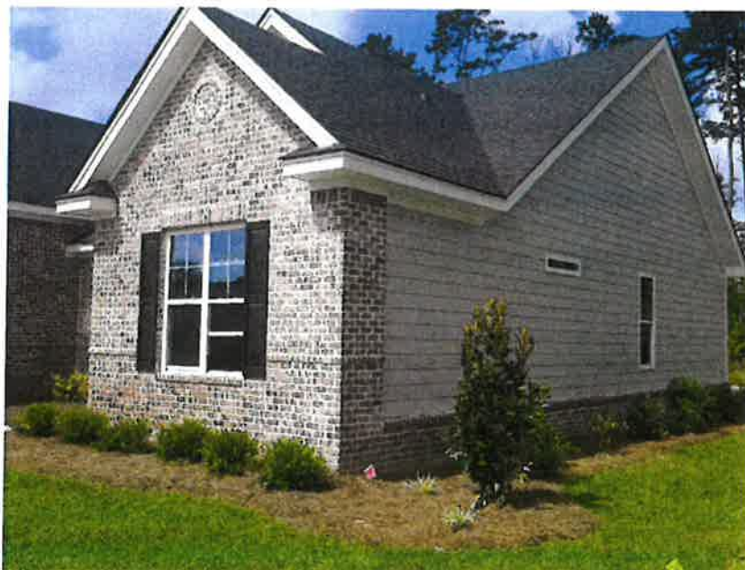
Photo Two Caption RIGHT VIEW 10/1/2018