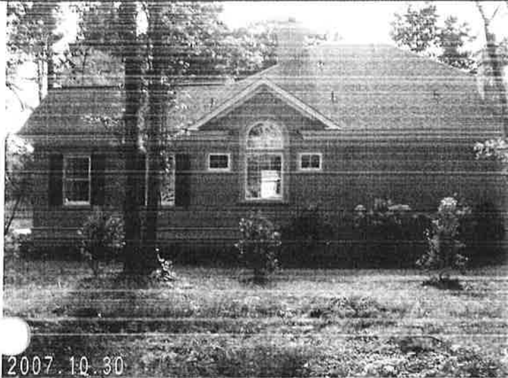
LEFT SIDE VIEW 10/29/07