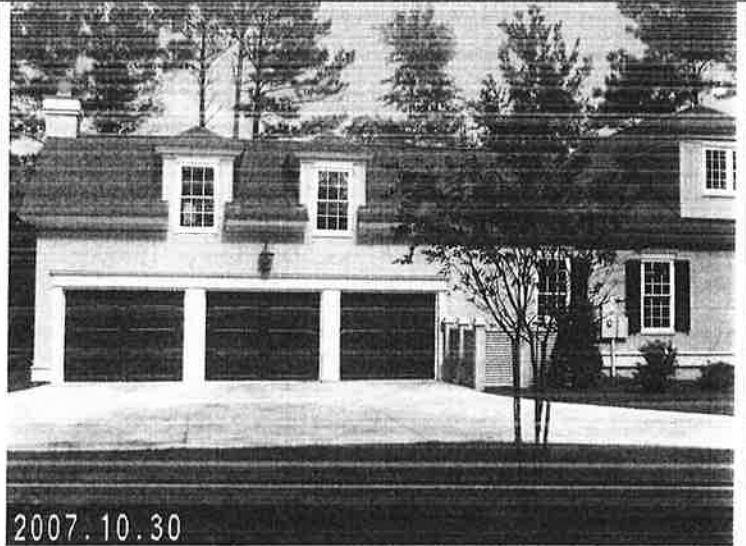
RIGHT SIDE VIEW 10/29/07