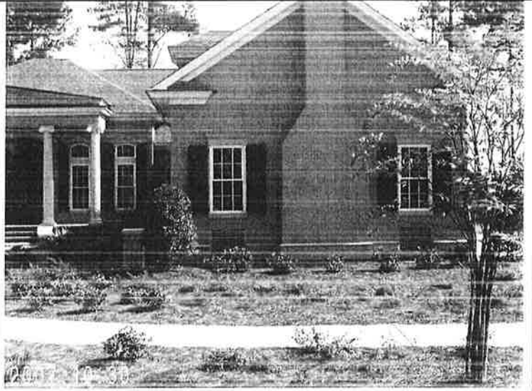
FRONT VIEW 10/29/07