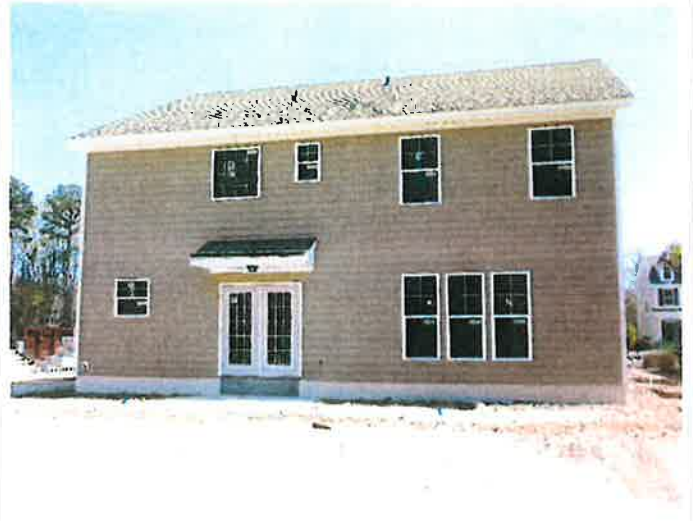
REAR VIEW 4/01/2013