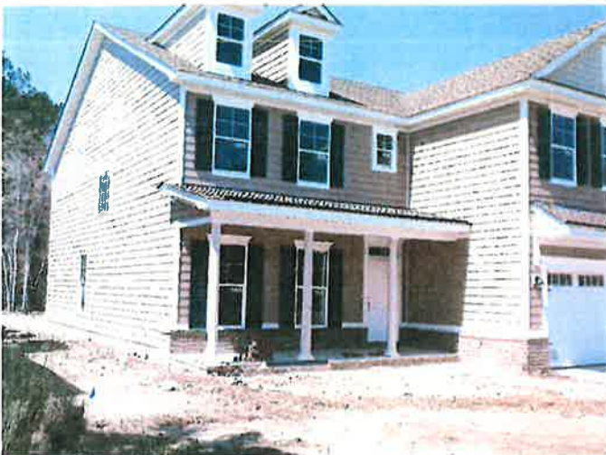
LEFT SIDE VIEW 4/01/2013