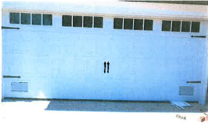
GARAGE DOOR 4/01/2013