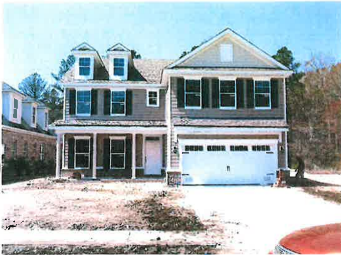
FRONT VIEW 4/01/2013