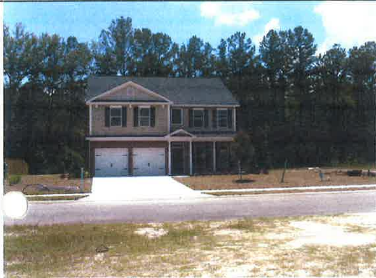
FRONT VIEW 05/28/2009