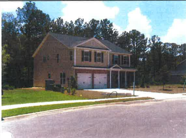
LEFT SIDE VIEW 05/28/2009