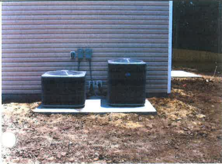
AIR-CONDITIONING COMPRESSORS 05/28/2009

If submitting more photographs than will fit on the preceding page, affix the additional photographs below. Identify all photographs with: date taken; "Front View" and "Rear View"; and, if required, "Right Side View" and "Left Side View."