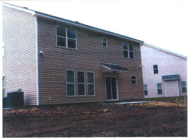
REAR VIEW 05/28/2009