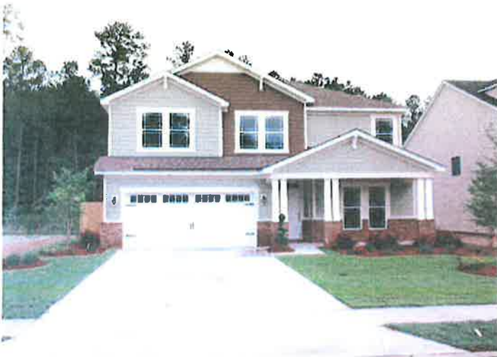
FRONT VIEW 6/12/2012