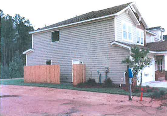
LEFT SIDE VIEW 6/12/2012