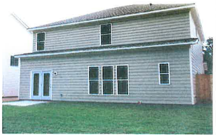
REAR VIEW 6/12/2012