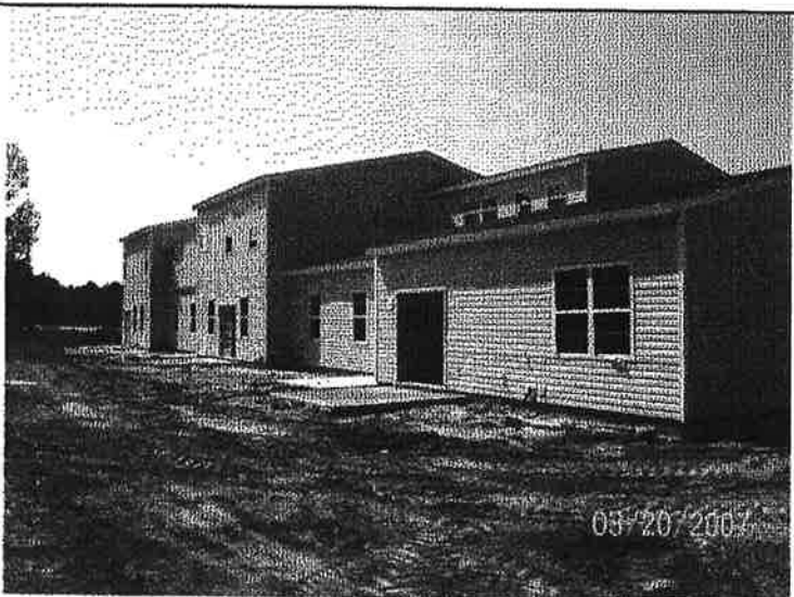
Rear View 7/16/06