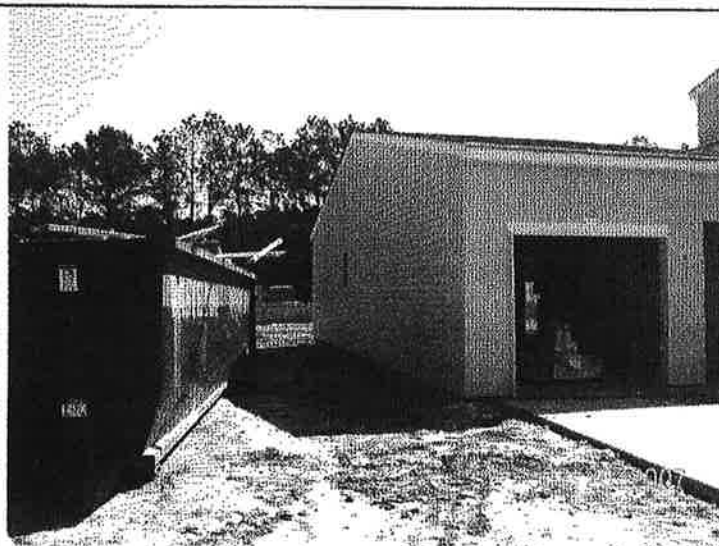
Left View 7/16/06