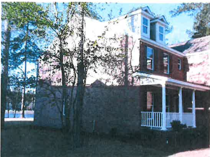
LEFT SIDE VIEW 2/25/2013