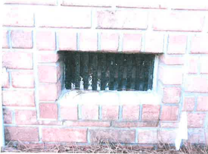
(TYPICAL) "DISABLED" AIR VENT USED AS FLOOD OPENING 2/25/2013