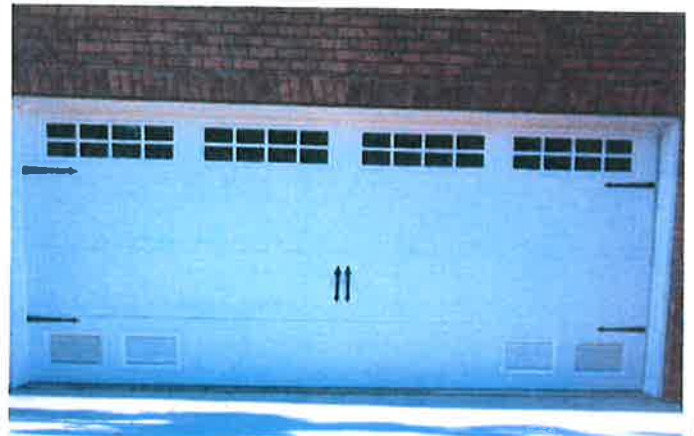
FLOOD VENTS IN GARAGE DOOR 2/25/2013