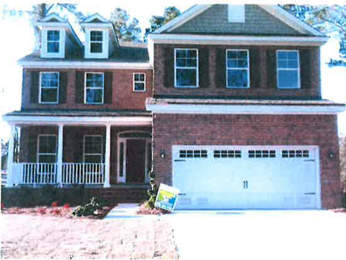
FRONT VIEW 2/25/2013