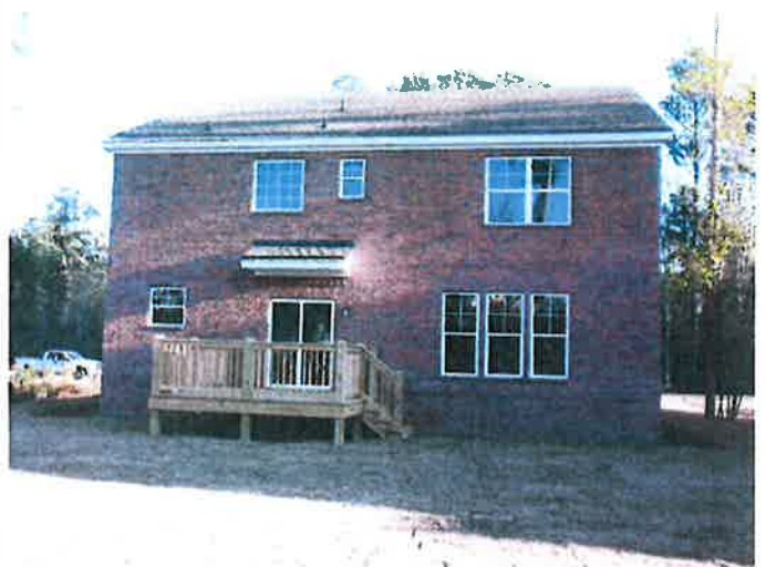
REAR VIEW 2/25/2013